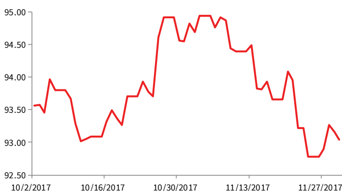
Figure 3: US Dollar erases October gains

Continuing economic and political uncertainties in the UK weighed on equities and can explain much of the 1.8% decline. Economic data was mixed with the all-sector Purchasing Managers' Index at the highest level in six months, yet in contrast retail sales growth weakened. In light of political uncertainties, Brexit complications and a poor outlook for labour productivity, the Office for Budget responsibility revised down GDP growth forecasts. Growth in 2017 is now forecasted at 1.5%, down from a 2.0% forecast made in March. Growth is expected to continue to slow, with 1.4% and 1.3% forecasted for 2018 and 2019 respectively. UK inflation held steady at a five year high of 3.0%, keeping pressure on real wage growth which is forecast to remain negative in October.