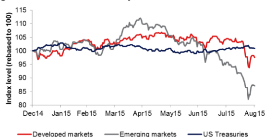
Figure 2: Asset class returns year-to-date.

The trigger for the falls was the surprise decision by China's authorities to devalue the renminbi by circa 3% over a period of three days in early August. Aside from raising questions around currency wars and the competitive impact on other countries, especially its Asian neighbours, the policy shift highlighted the deep seated economic problems in China and the difficulties faced by the ruling Communist Party in maintaining growth near the target of 7%.