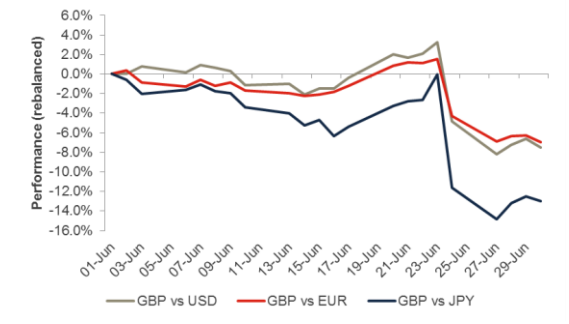
Figure 1: Sterling vs major currencies June 16

More telling signs of Brexit's economic implications came from bond markets, currencies, domestically focused UK equities, and UK and European financials. UK bond yields fell as the Bank of England signalled its readiness to loosen monetary policy. The Federal Reserve is also expected to delay a rate rise until 2018, and both the European Central Bank (ECB) and Bank of Japan are expected to ease policy further. In the UK, 10-year government bond yields have fallen by 0.60 percentage points to below 1.0%. In the US, falls of 0.40 percentage points have taken the 10-year to a new all-time low of 1.4% (at time of writing, yields have declined further to reach 1.3%). And in Germany and Japan, the 10-year yields on government bonds have now fallen into negative territory. The pound fell by 10.5% versus the greenback from the day of the referendum to month-